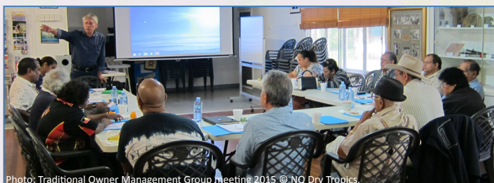
Photo: Traditional Owner Management Group Meeting 2015