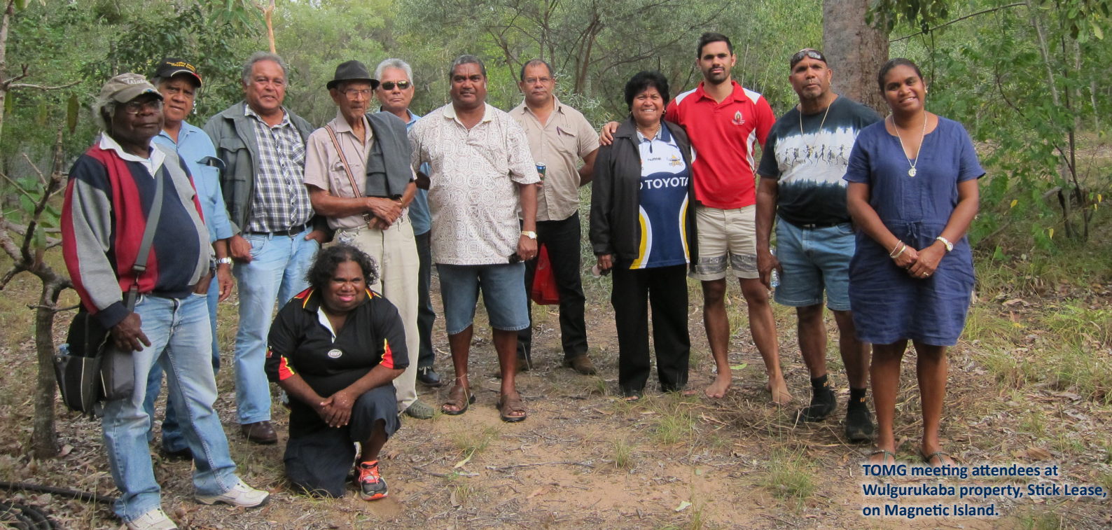
TOMG meeting attendees at Wulgurukaba property, Stick Lease, on Magnetic Island.